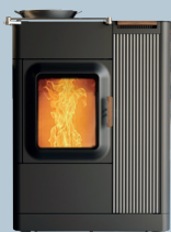
MO DUO COOK